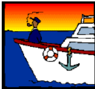
Cice.....is that you?